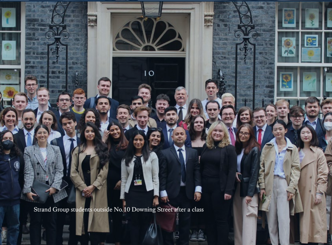
Strand Group students outside No.10 Downing Street after a class