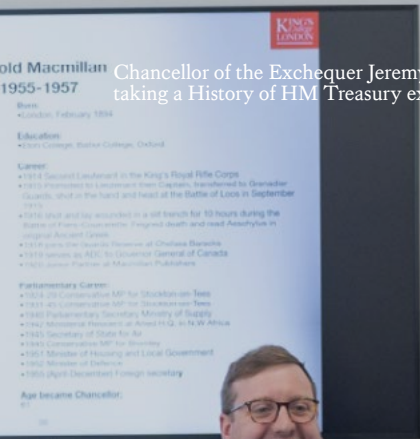
Chancellor of the Exchequer Jeremy Hunt MP speaking to officials taking a History of HM Treasury executive education class